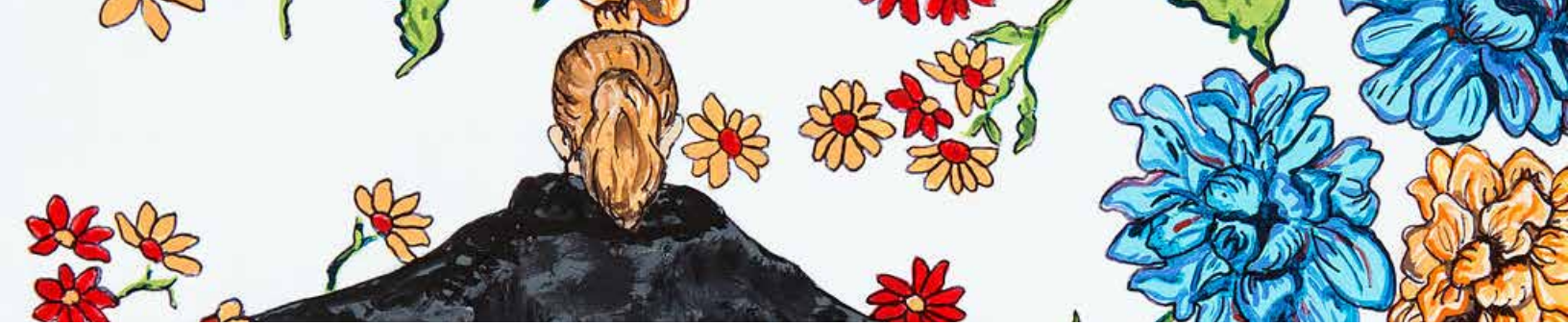
Top banner art is part of a plate from 2018 300 Plates by Megan Hallett. It is used on pages 11-14 of this report